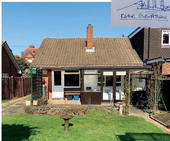
As told to: Georgina Townshend

← The back of the bungalow, which will soon feature a kitchen extension.